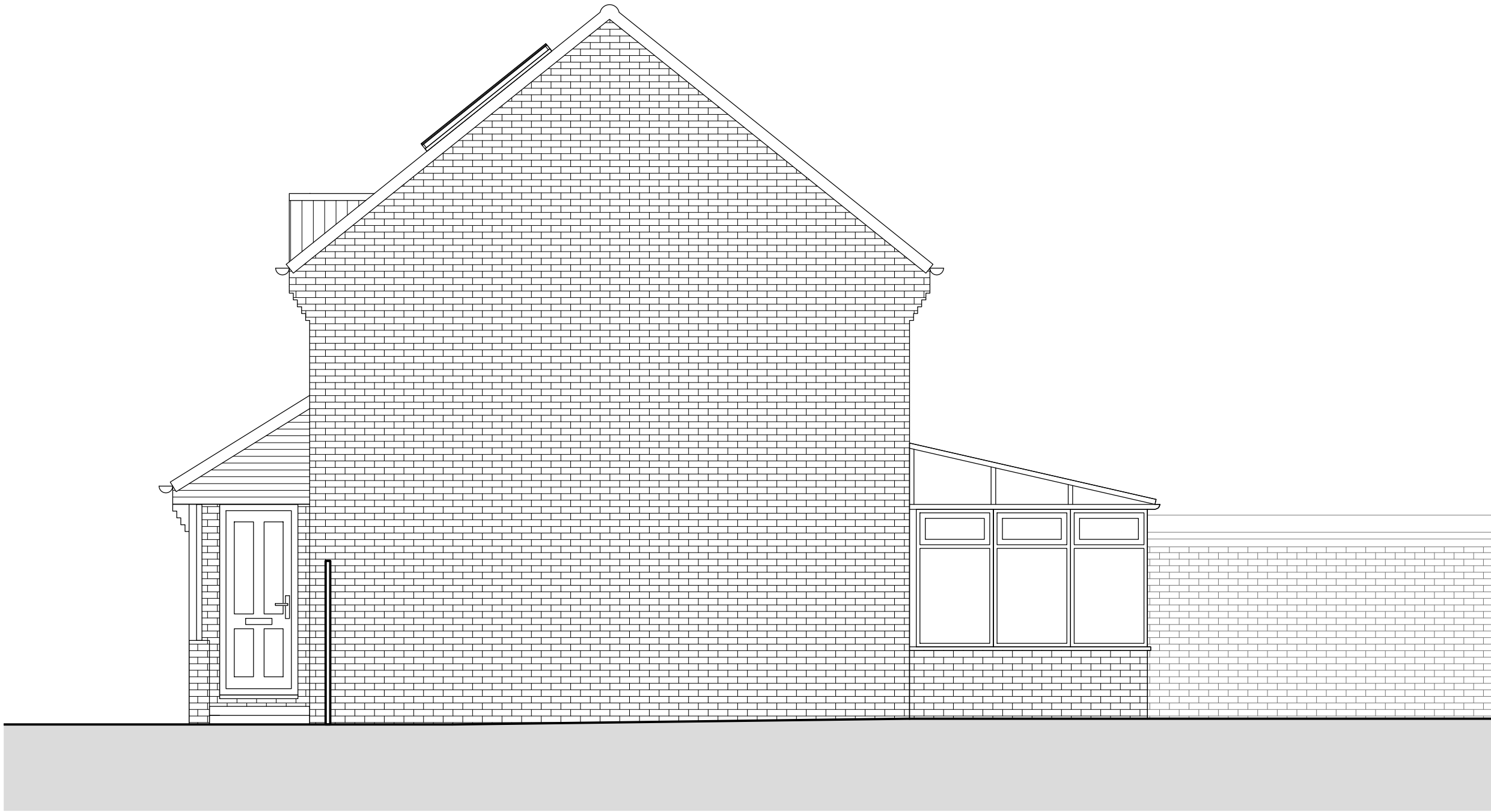
East Elevation as PROPOSED 1:50