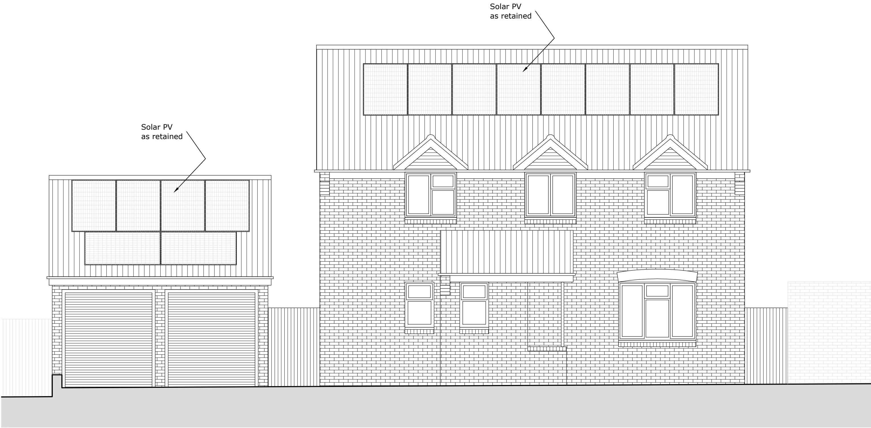
South Elevation as PROPOSED 1:50