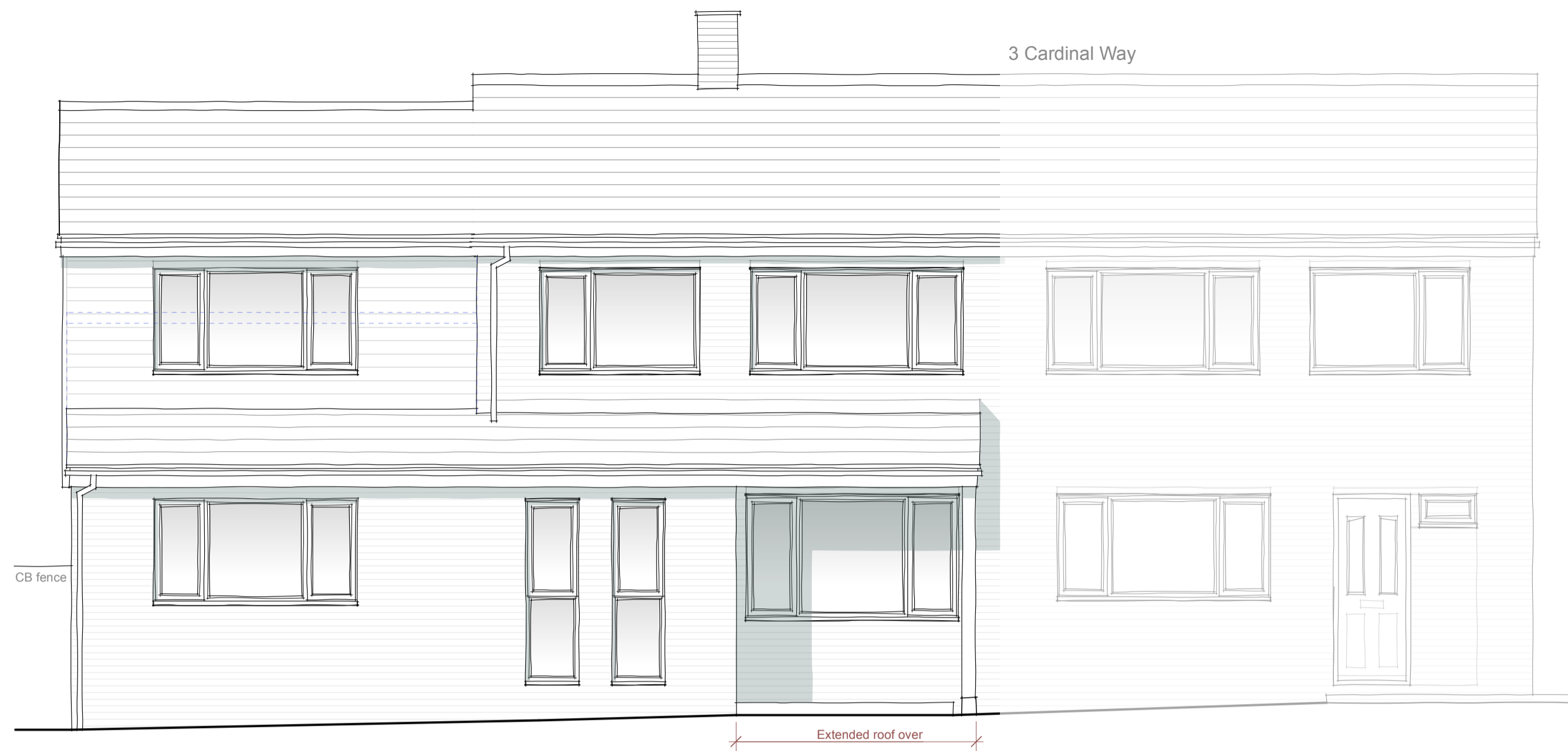
Proposed Front (North West) Elevation Scale 1:50 @ A1