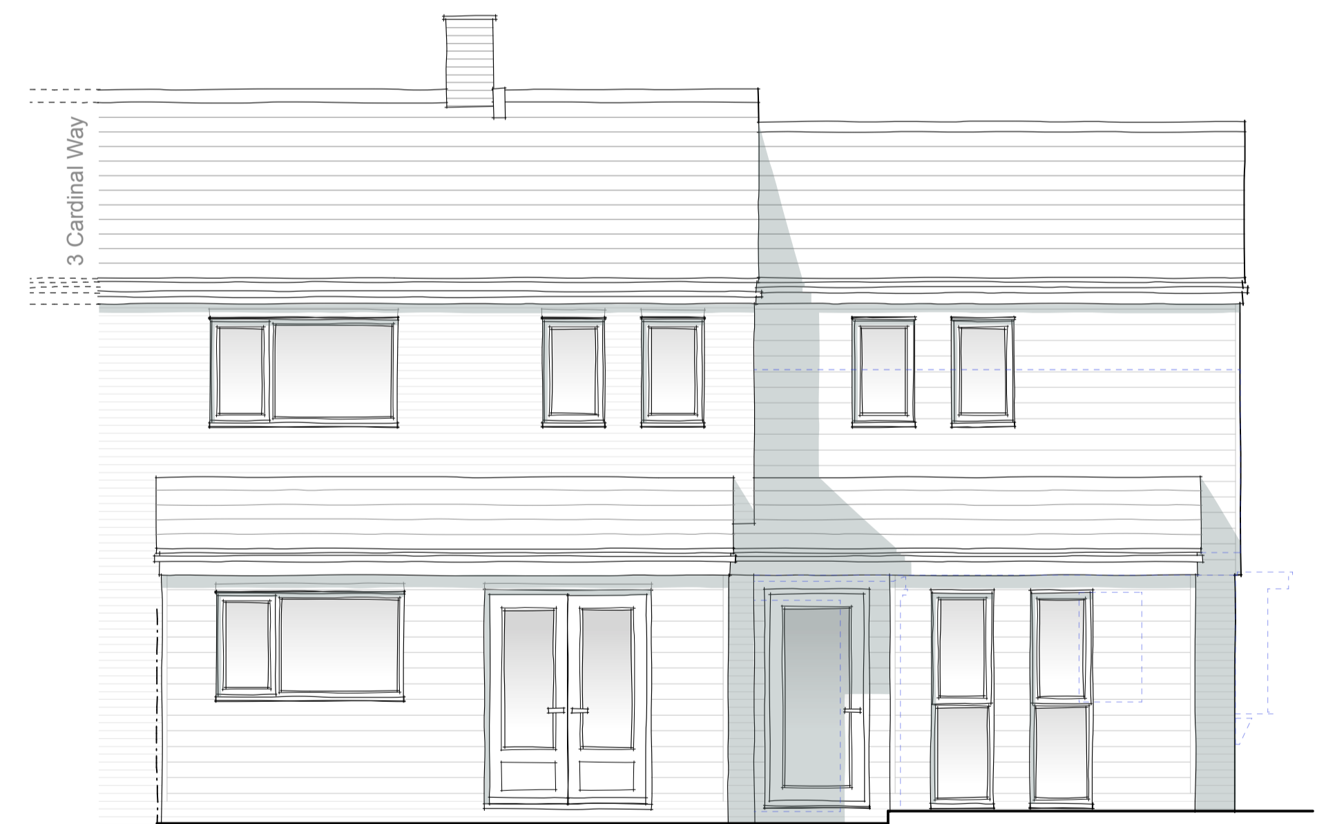
Proposed Rear (South East) Elevation Scale 1:50 @ A1