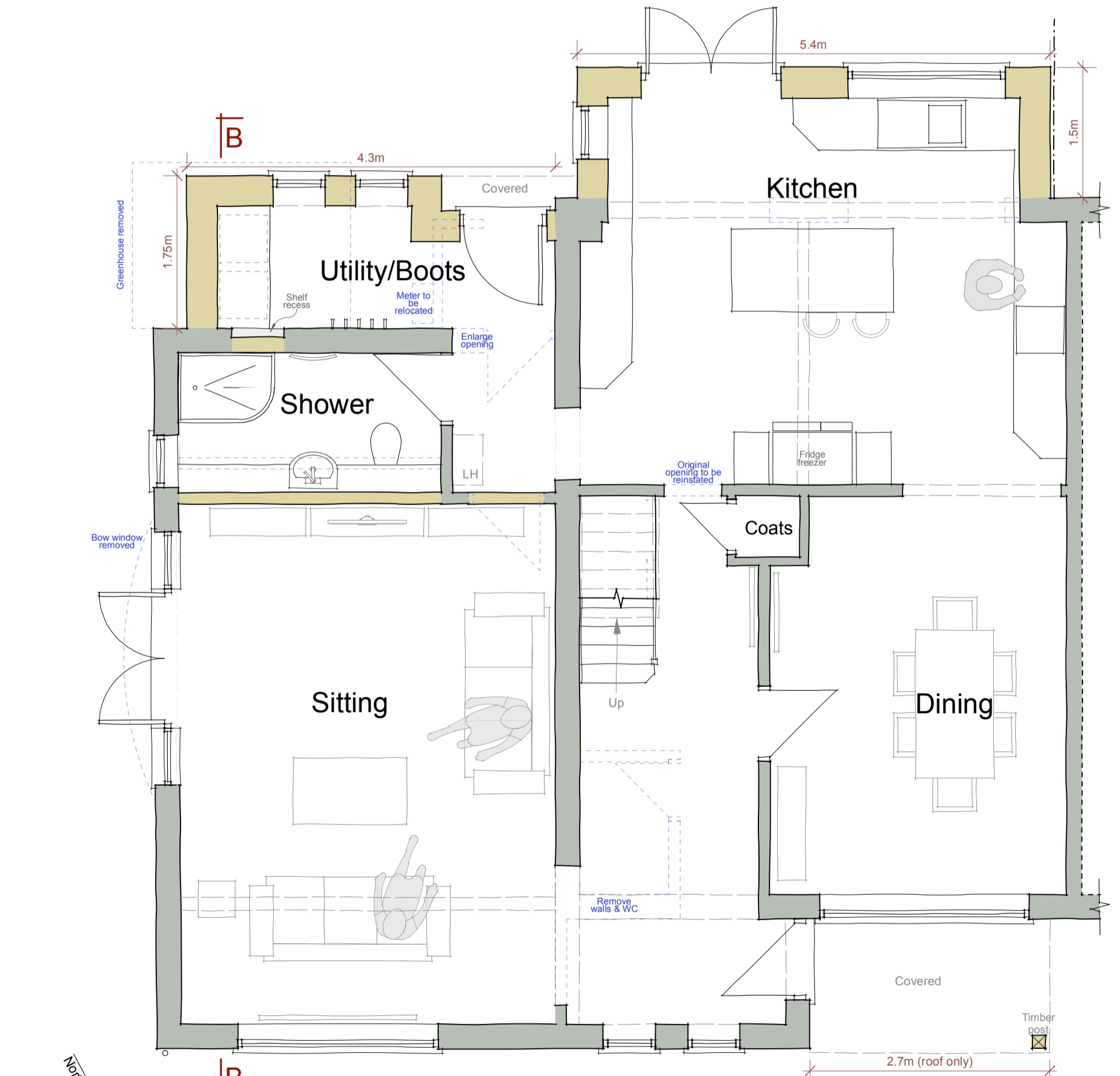
Proposed Ground Floor Plan Scale 1:50 @ A1

Contractor is responsible for all setting out and must check dimensions on site before work is put in hand. Written dimensions only to be taken, this drawing must not be scaled. JAP Architects to be immediately notified of suspected omissions or discrepancies. ©