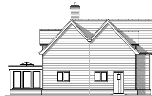
Side Elevation (South-West)