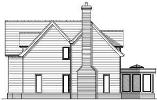
Side Elevation (North-East)