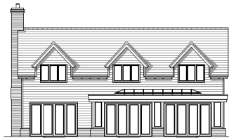
Rear Elevation (North-West)