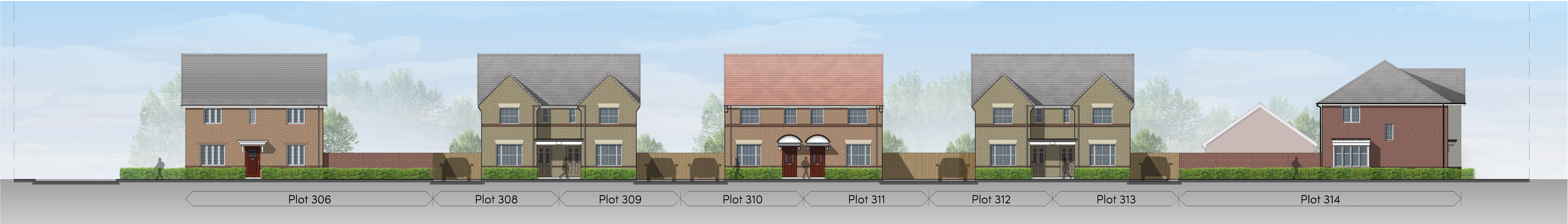
PROPOSED STREET SCENE M-M @ 1:100