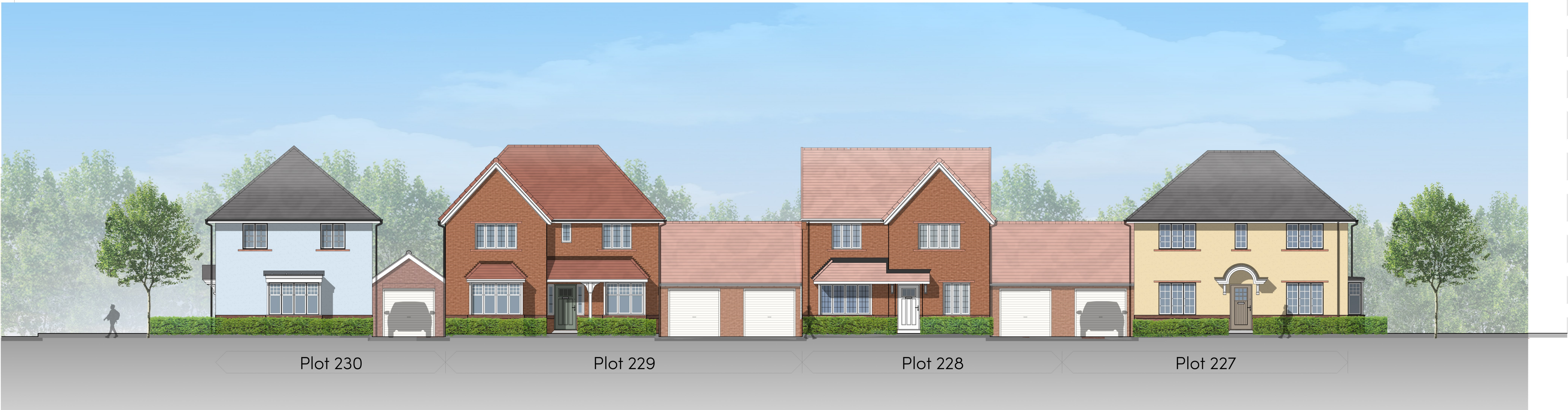
PROPOSED STREET SCENE N-N @ 1:100