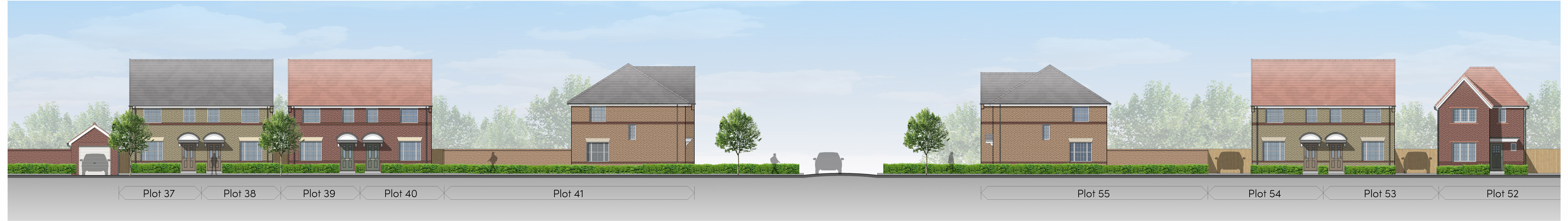
PROPOSED STREET SCENE C-C @1:100