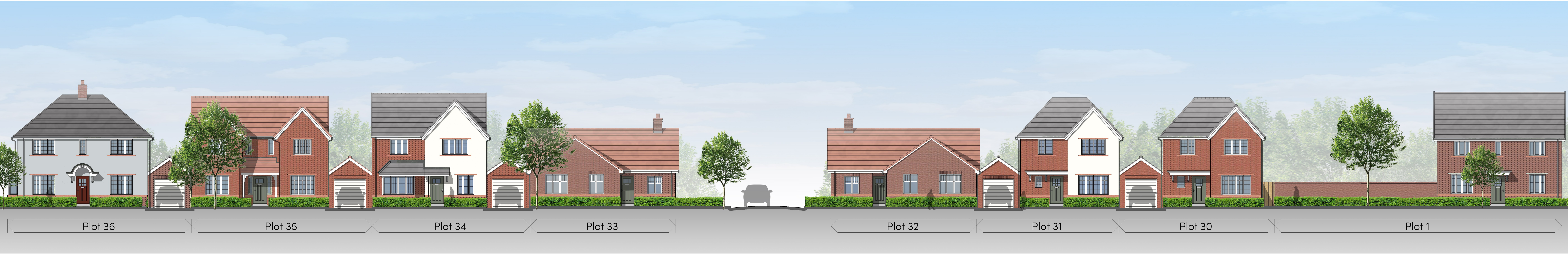
PROPOSED STREET SCENE B-B @1:100