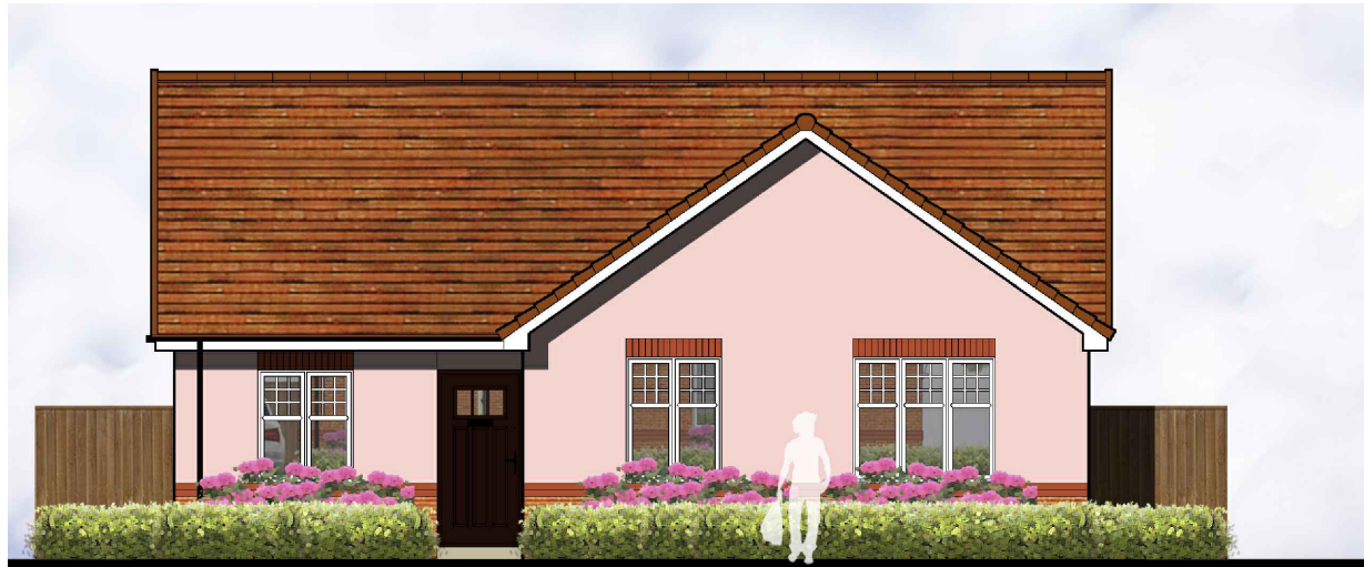
CLA303 FRONT ELEVATION Refer to materials plan for individual plot finishes