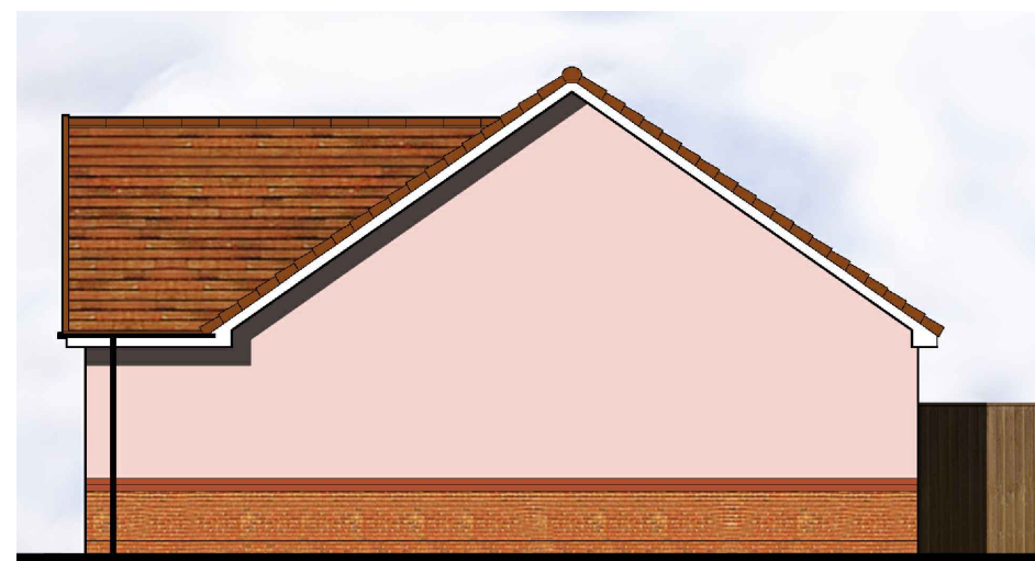
CLA303 SIDE ELEVATION