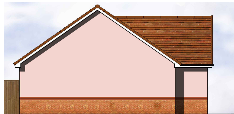
CLA303 SIDE ELEVATION