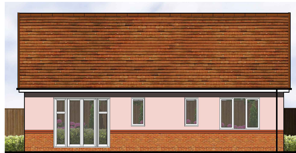
CLA303 REAR ELEVATION

* Denotes floor areas shown to comply with National Described Space Standards (see schedule). Room layout shown as furnished and does not demonstrate compliance.