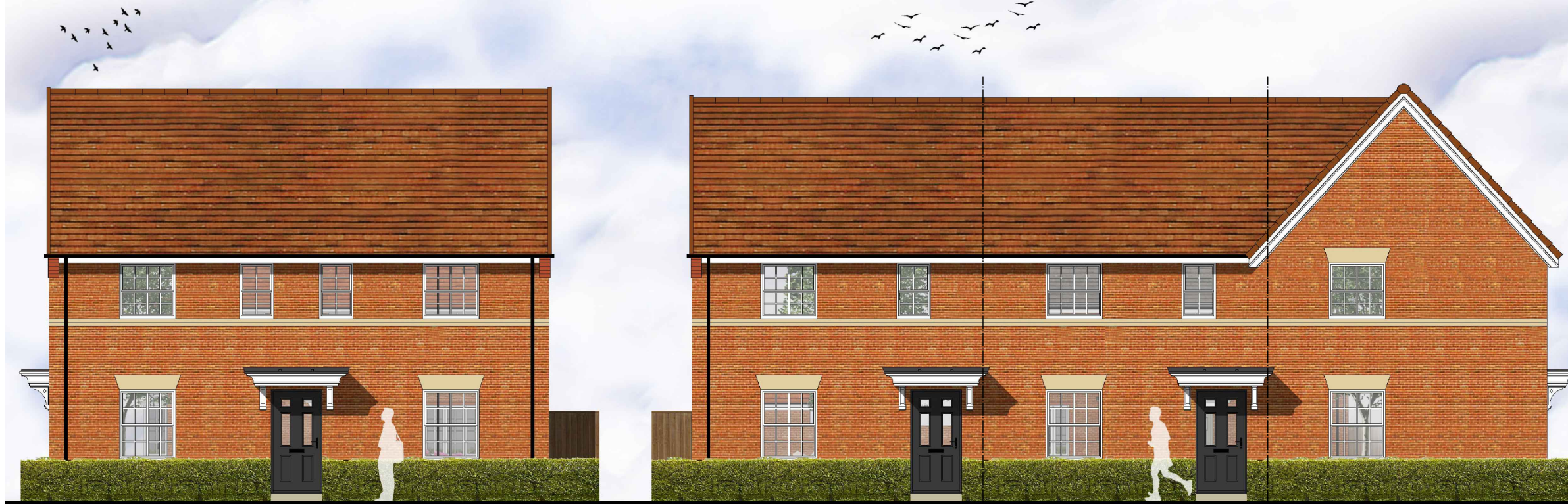
B80059.NSS.M3B5PCT FRONT ELEVATION