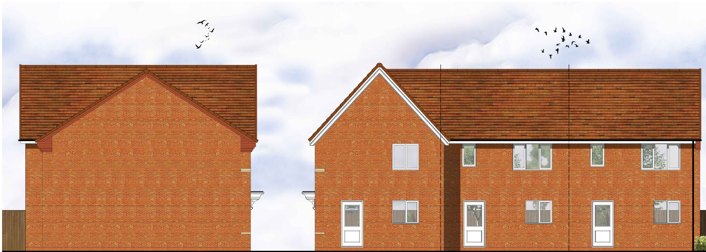
NSS.M3B5P-1 SIDE ELEVATION