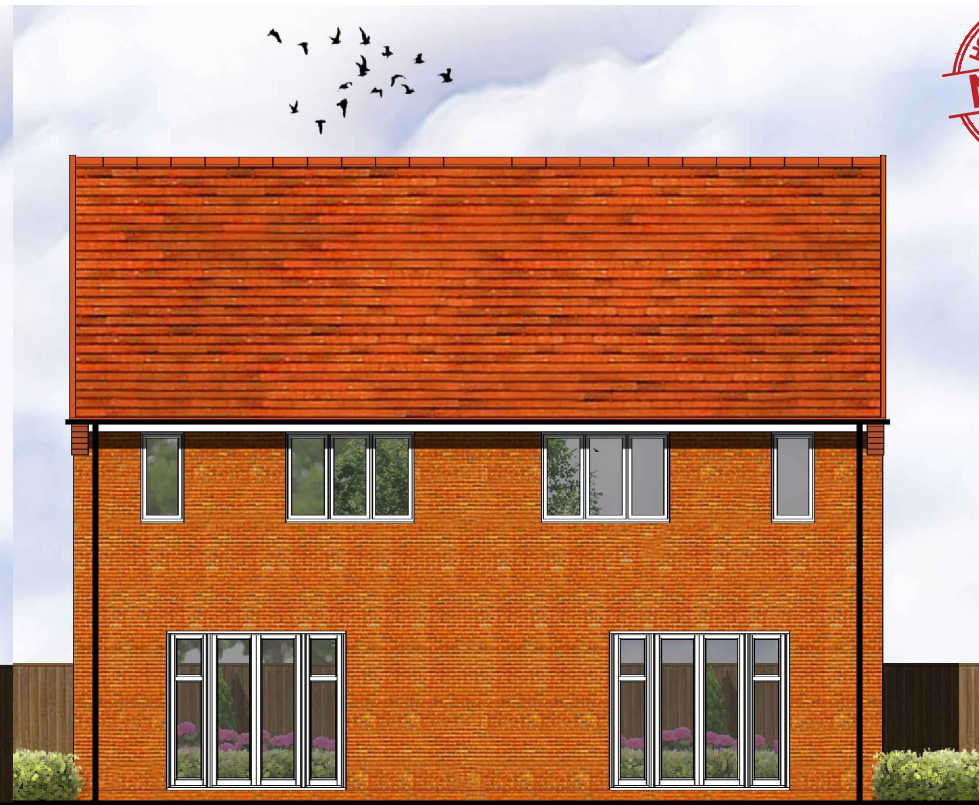
QANSS.372-1 REAR ELEVATION