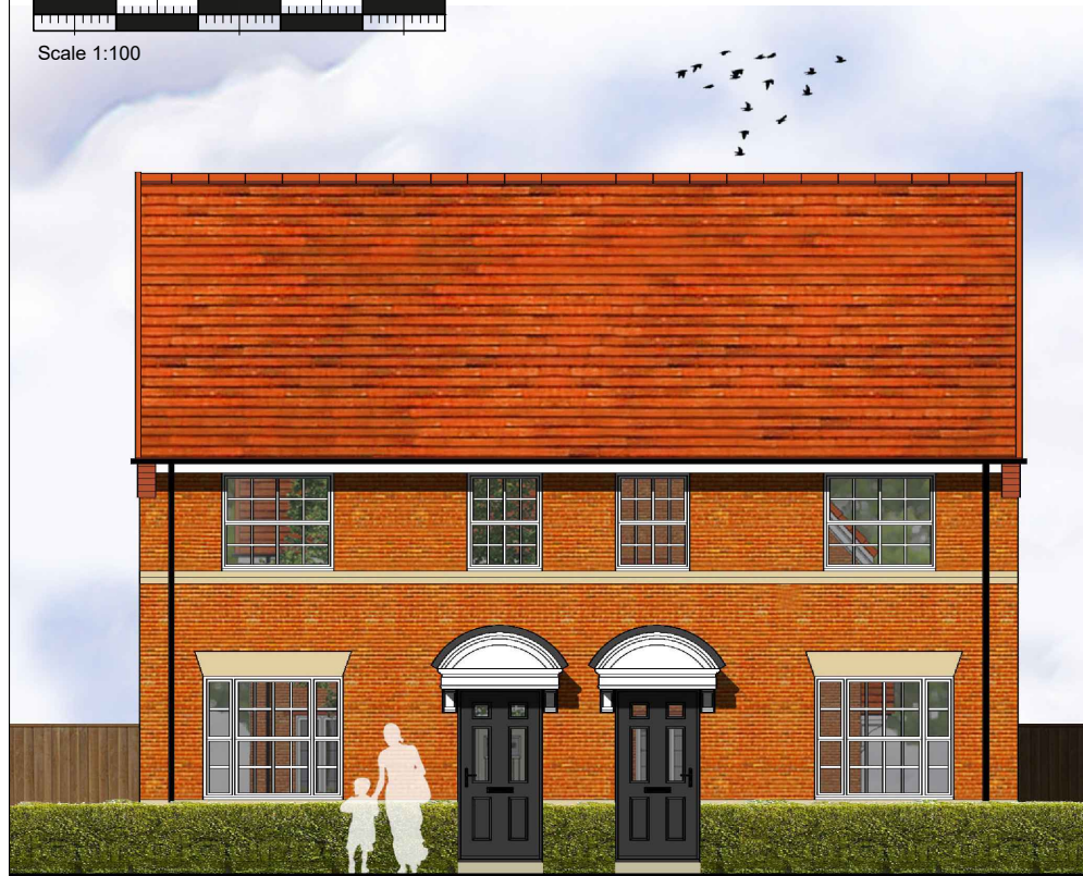
QANSS.372 FRONT ELEVATION