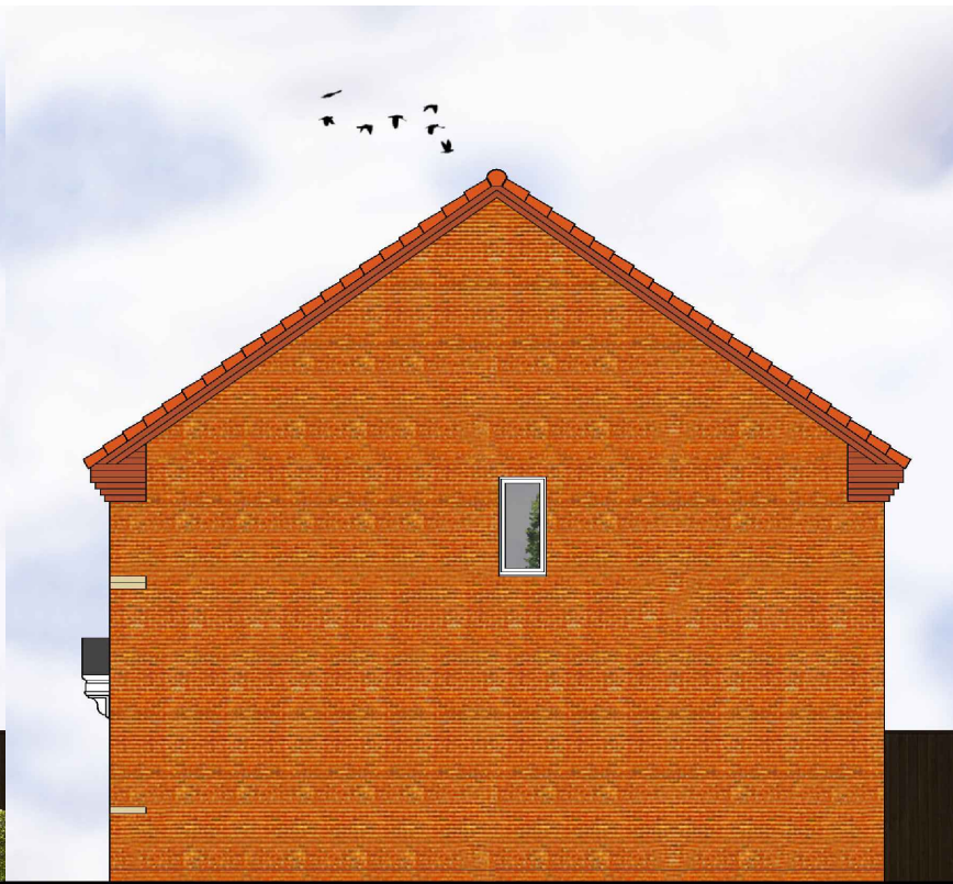
QANSS.372-1 SIDE ELEVATION