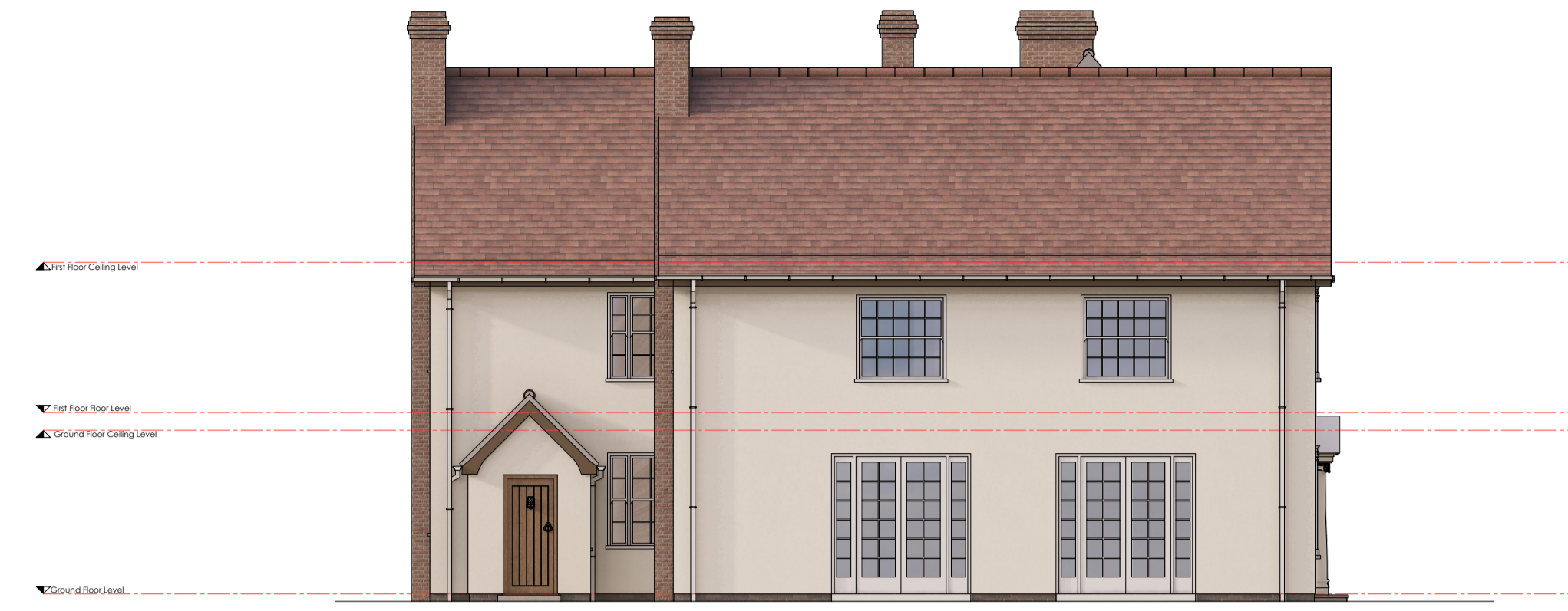
Elevations: Side Scale 1:100