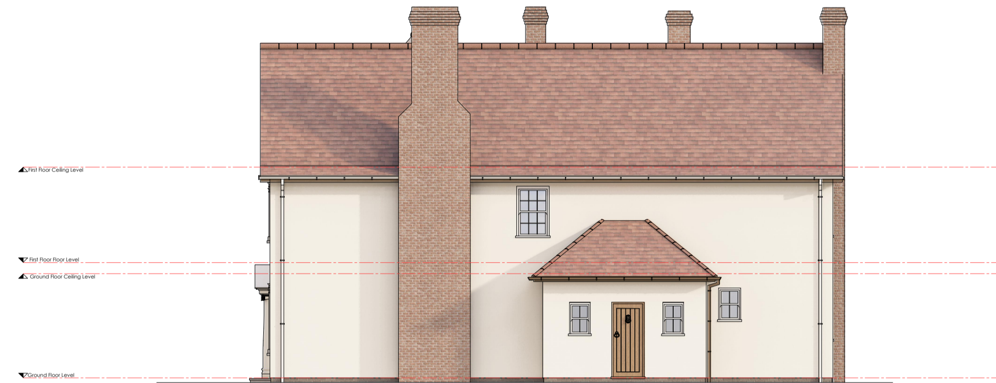
Elevation: Side Scale 1:100