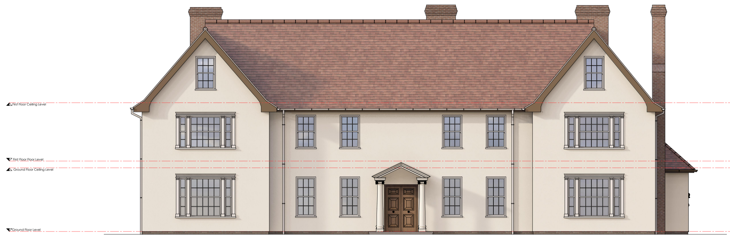
Elevations: Front Scale 1:100