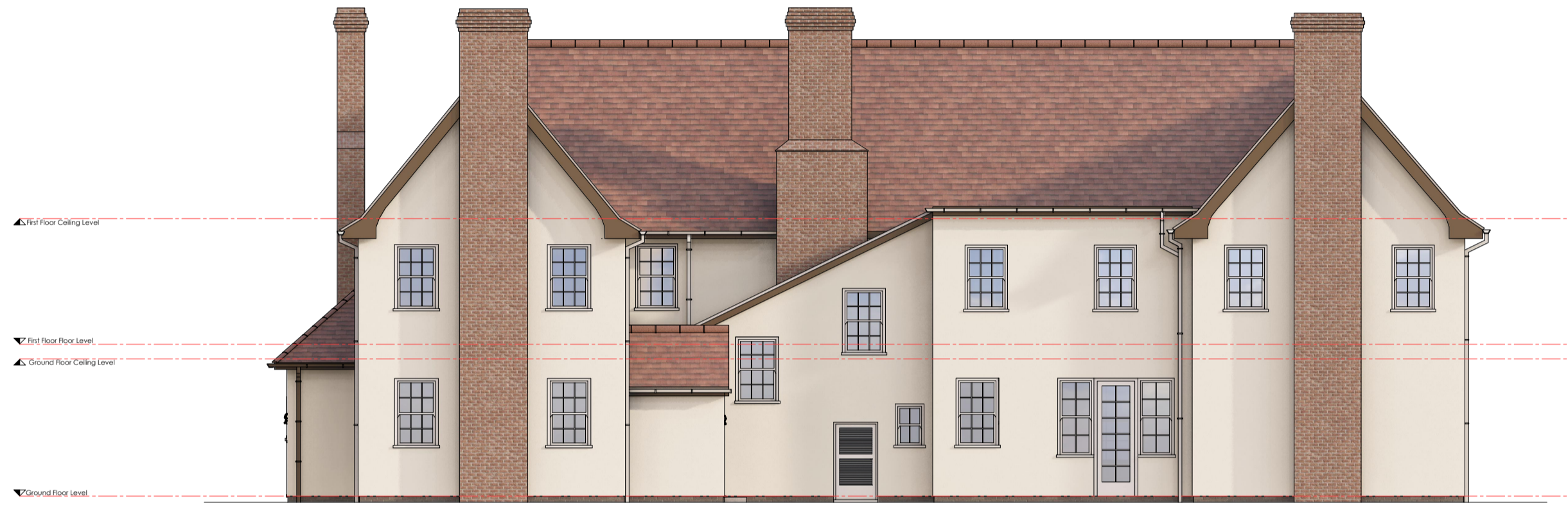
Elevation: Rear Scale 1:100