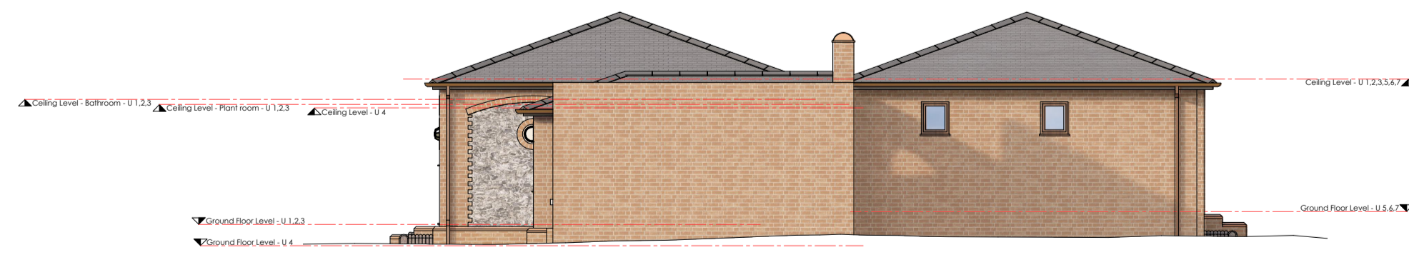
Elevation: Side Scale 1:100