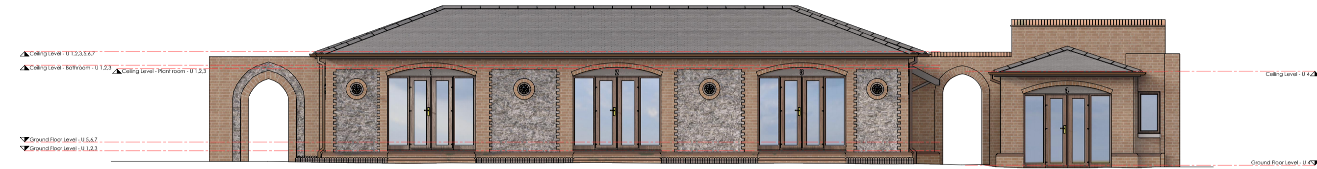
Elevation: Rear Scale 1:100