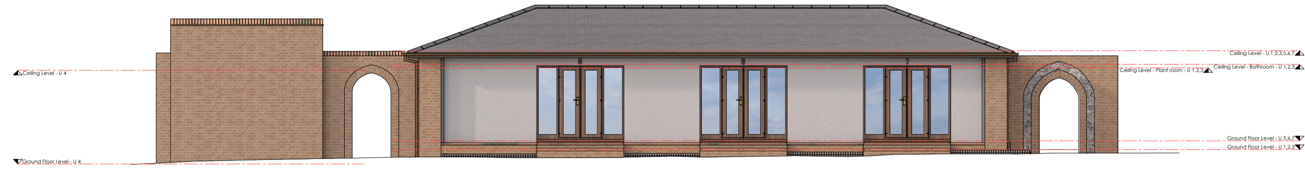
Elevation: Front Scale 1:100