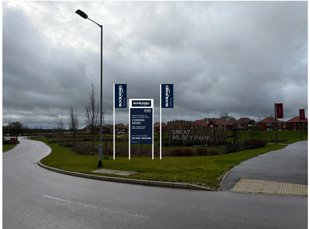
Sign to be placed in the location shown above