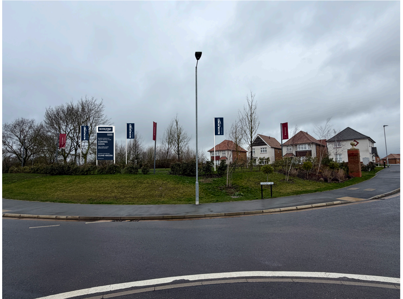
Sign to be placed in the location shown above