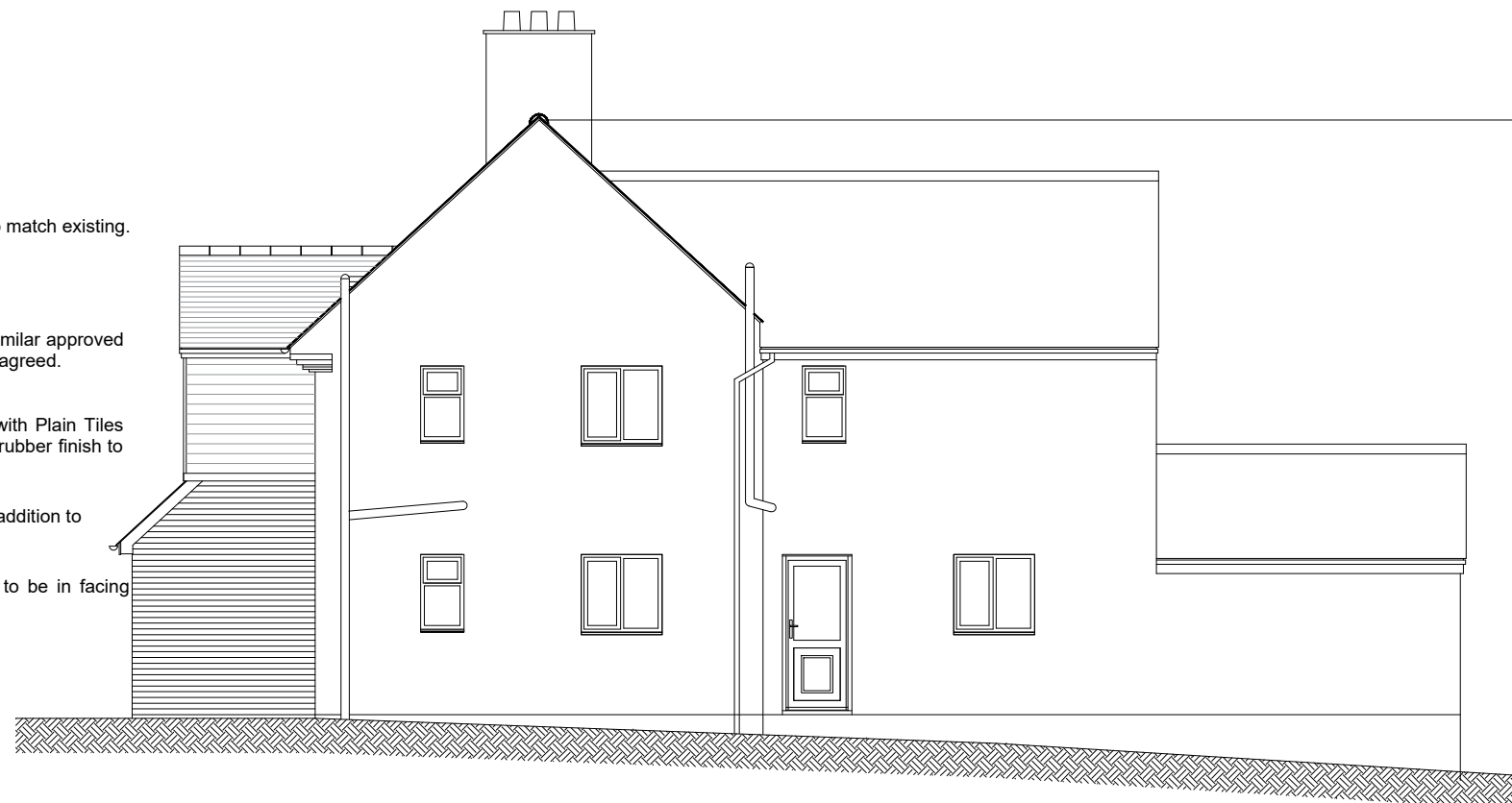
PROPOSED SOUTH FACING ELEVATION