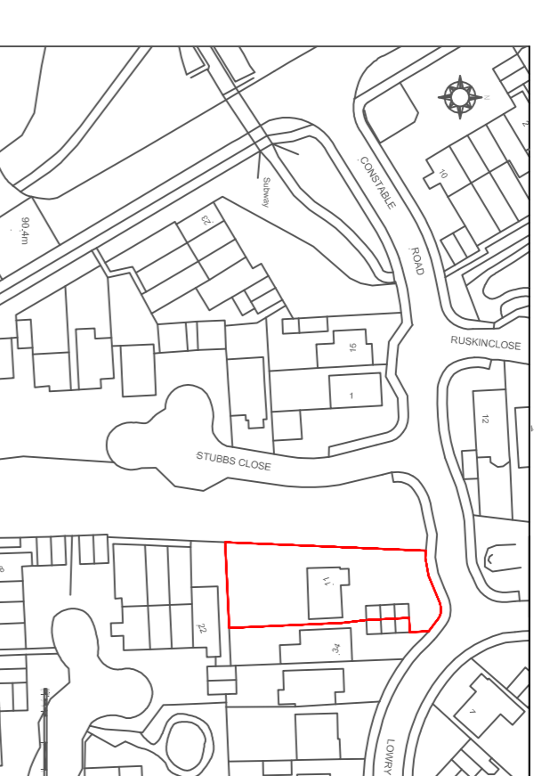
Crown Copyright and database rights 2023 OS Licence no. 100051661 Location plan Scale 1:1250