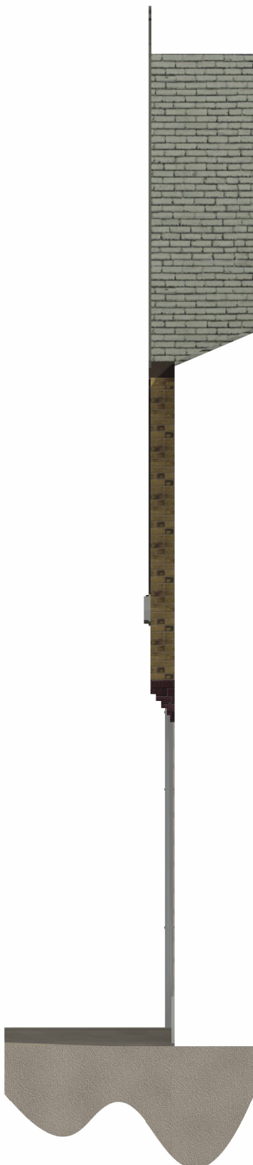
PROPOSED ATM ELEVATION - SIDE 1 : 50