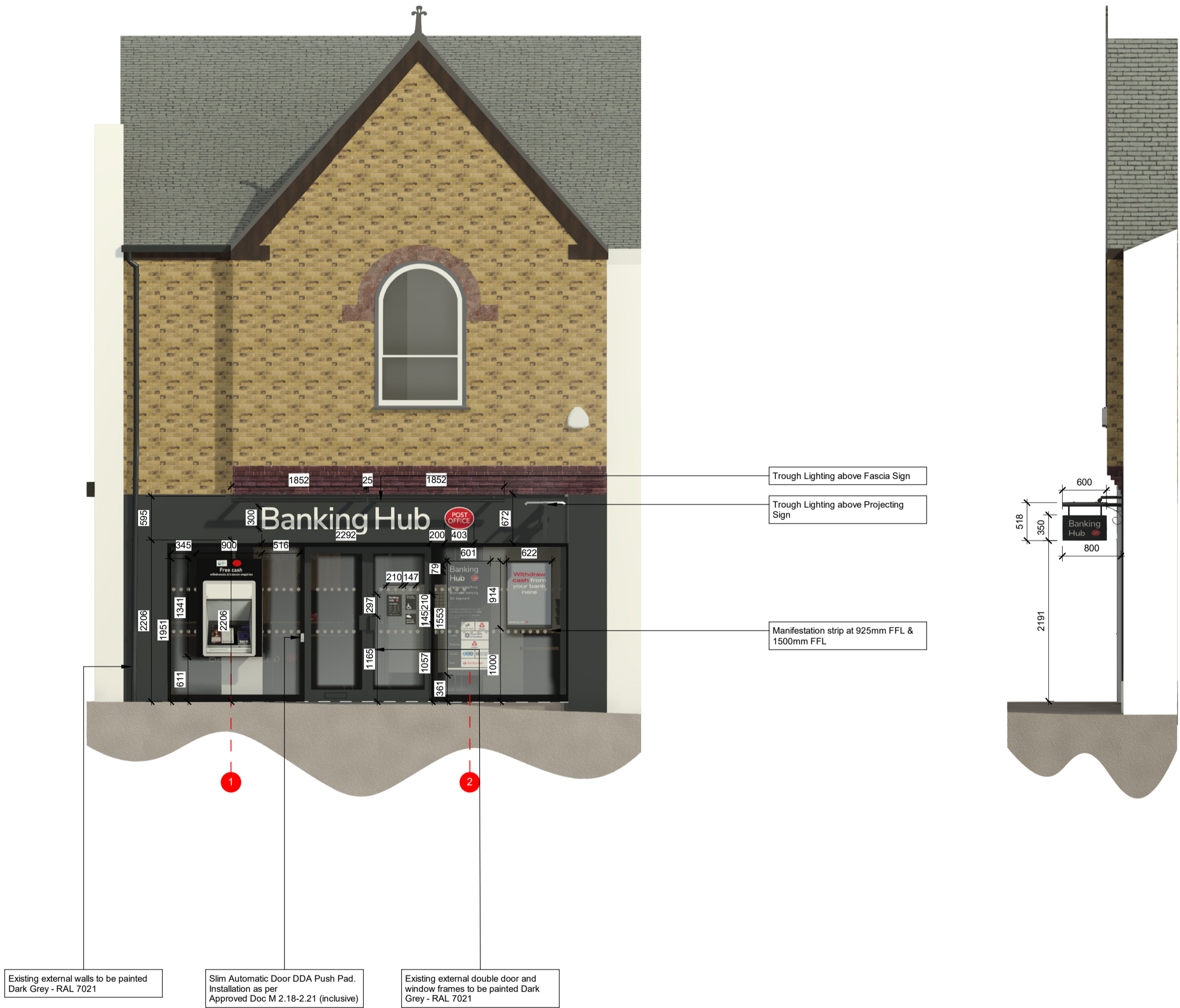
PROPOSED ATM ELEVATION - FRONT 1 : 50